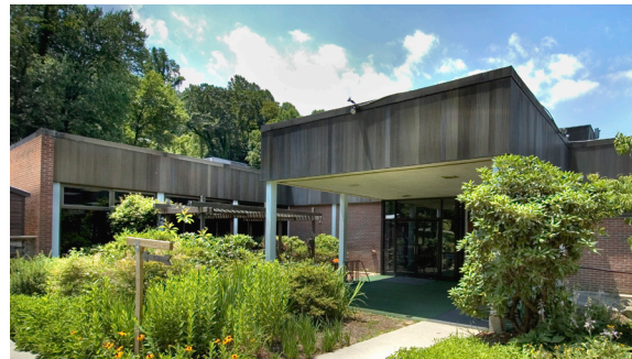
Marianna Black Library, Bryson City, NC, which opened in 1970.