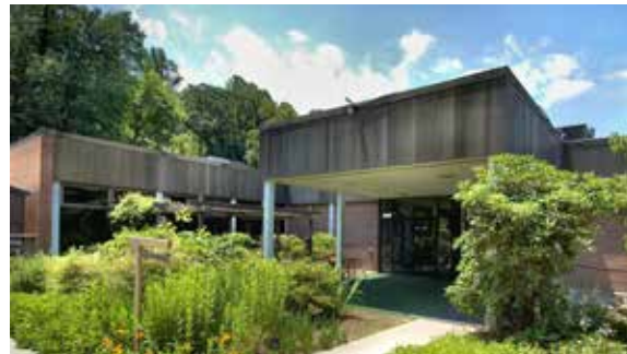
Marianna Black Library, Bryson City, NC, which opened in 1970.